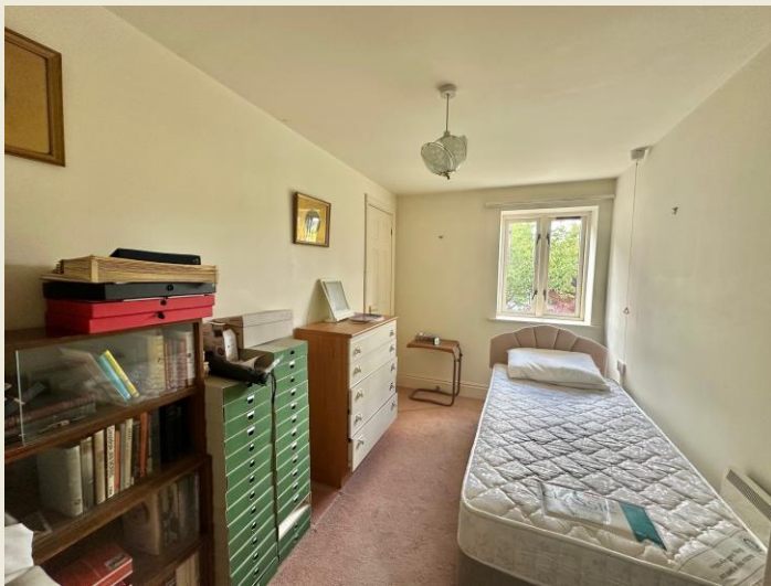
BEDROOM TWO 11'11 x 7'2