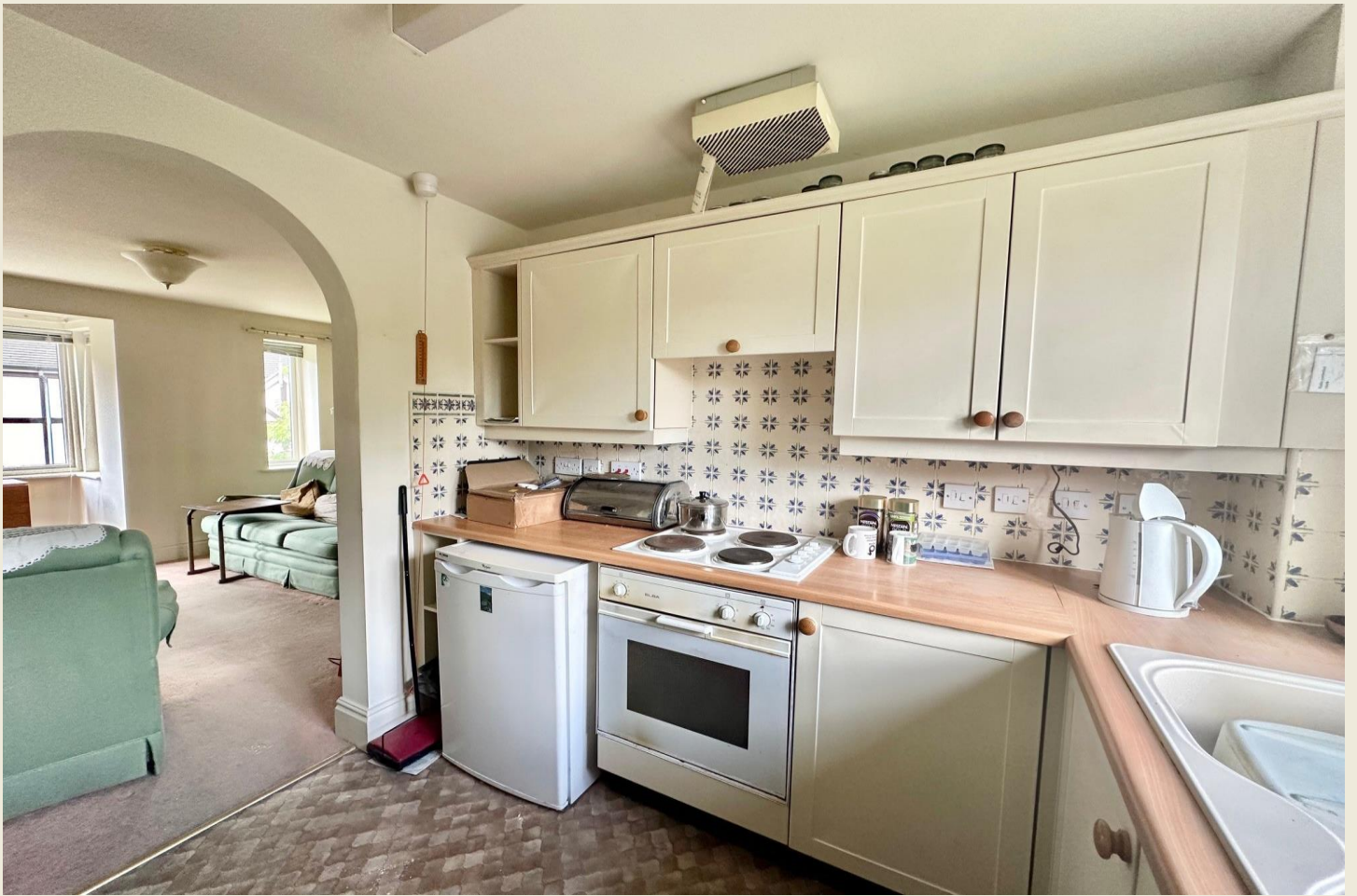
KITCHEN BREAKFAST ROOM 8'7 x 8'6