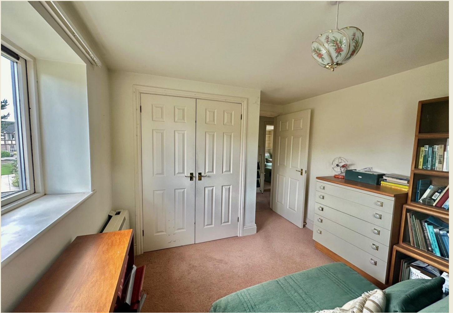
BEDROOM ONE 11'10 x 9'1