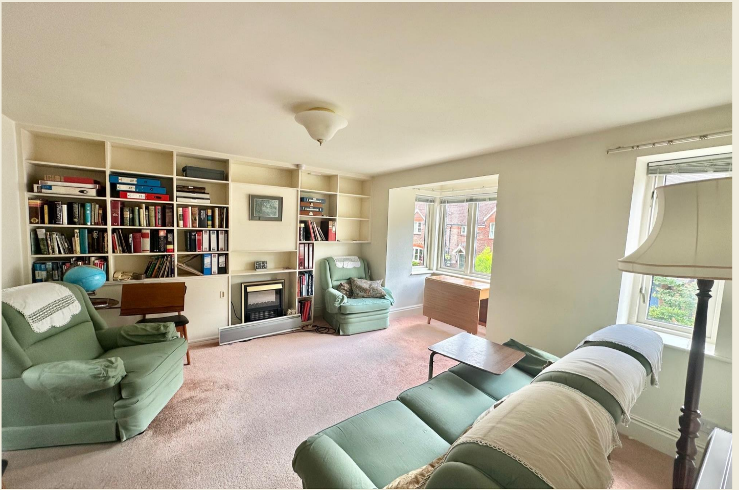
LIVING DINING ROOM 14'7 x 12'5