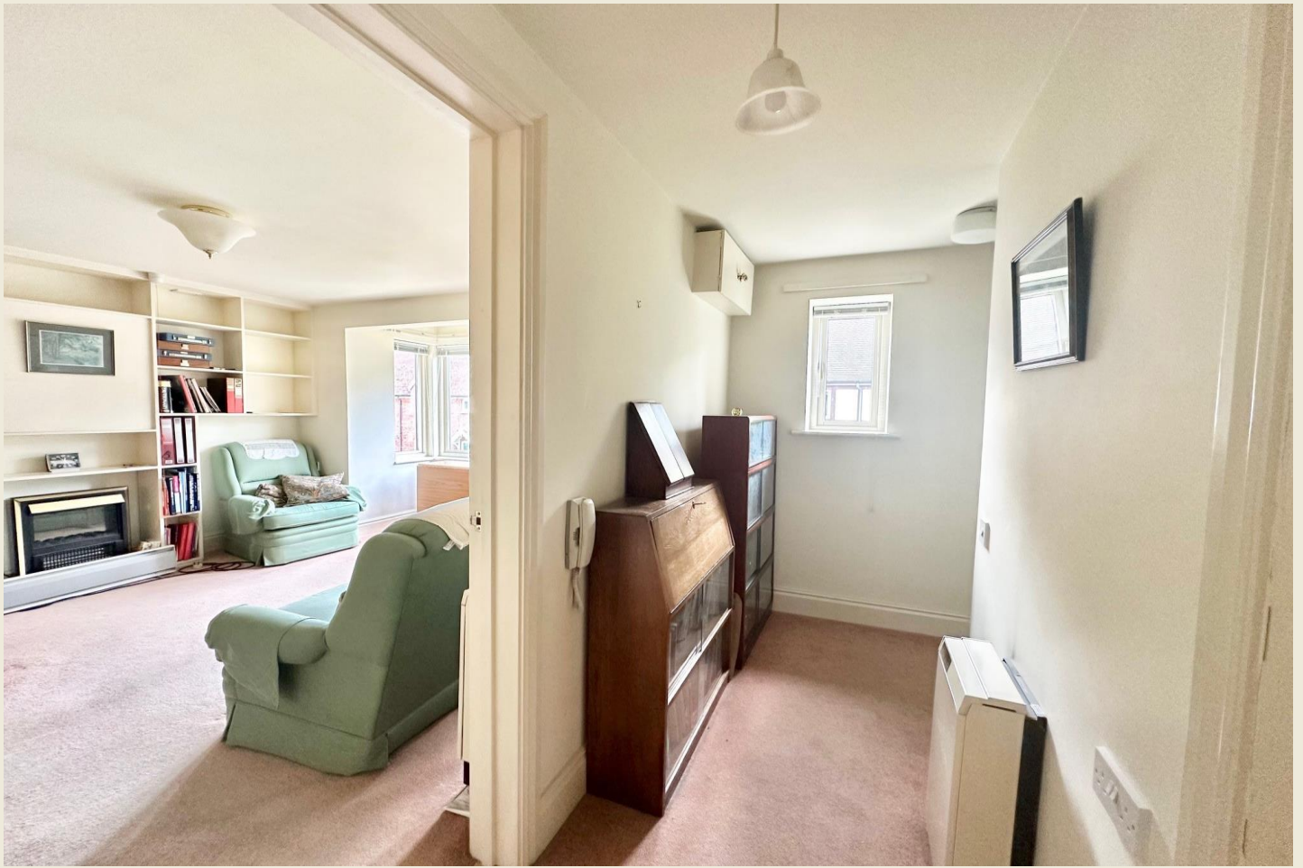
THE ACCOMMODATION:- With approximate dimensions, comprises;